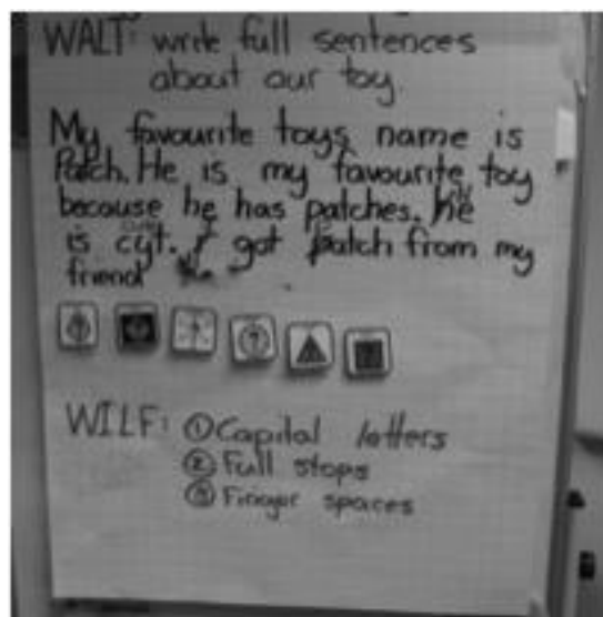
Figure 1: The schooled expectations for the task

Below (Fig. 1) is a photograph of the text the teacher produced with children to demonstrate these expectations: