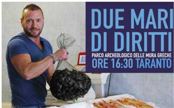
Poster for the 2016 Apulia Pride in Taranto

1 2 3 4 5 6 7 8 9 10 11 12 13 14 15 16 17 18 19 20 21 22 23 24 25 26 27 28 29 30 31 32 33 34 35 36 37 38 39 40 41 42 43 44 45 46 47 48 49 50 51 52 53 54 55 56 57 58 59 60