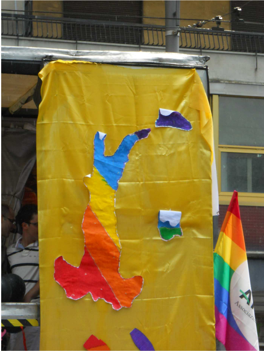
Queer Italy upside down

1 2 3 4 5 6 7 8 9 10 11 12 13 14 15 16 17 18 19 20 21 22 23 24 25 26 27 28 29 30 31 32 33 34 35 36 37 38 39 40 41 42 43 44 45 46 47 48 49 50 51 52 53 54 55 56 57 58 59 60