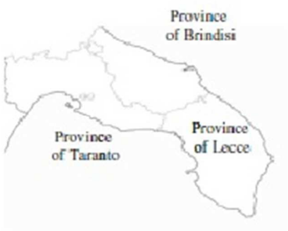
The Peninsula of Salento (from Pino and Peluso 2018)

1 2 3 4 5 6 7 8 9 10 11 12 13 14 15 16 17 18 19 20 21 22 23 24 25 26 27 28 29 30 31 32 33 34 35 36 37 38 39 40 41 42 43 44 45 46 47 48 49 50 51 52 53 54 55 56 57 58 59 60