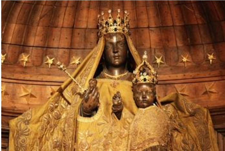
Figure 2. Le Puy